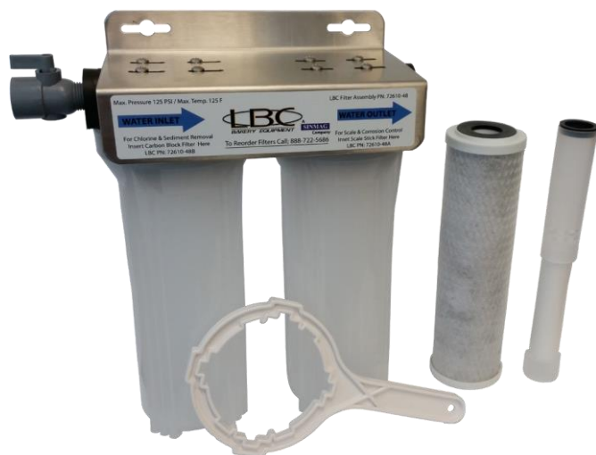
72610-48 Filter System Shown