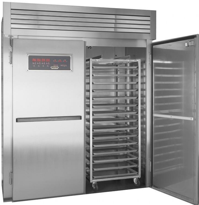
LRP2N-40 (rack not included)