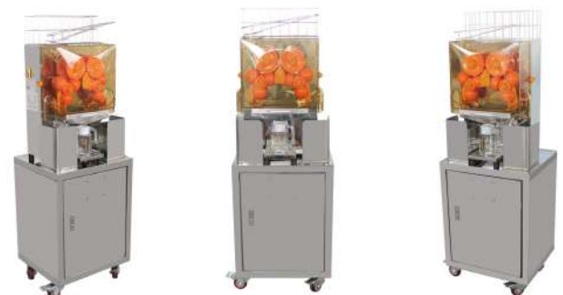
Item 44289 Stainless steel stand with a polypropylene bucket