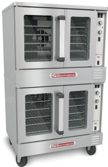
BGS/22SC shown with optional casters