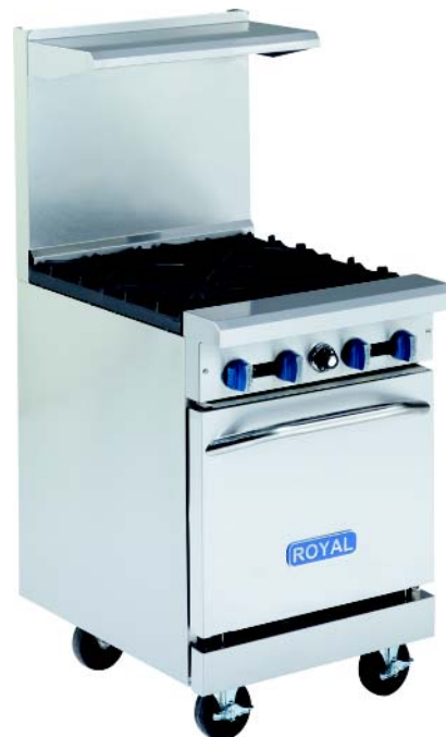
RR-4 Shown With Optional Casters

Royal Restaurant ranges have been designed to give the most useful features at an affordable cost. All stainless steel sides, and front panels, including the oven doors and kick plate are easily cleaned and rugged enough to withstand the constant heavy usage of a busy kitchen. Oven interiors are porcelain coated on all contact surfaces for fast and easy cleanup. The ovens are thermostatically controlled with 100% safety on the pilots to shut off the oven gas flow if the flame should go out. There is a push button ignitor for easy lighting of the oven pilot. 12" x 12" heavy cast iron grates cover the unique two piece lift off burners, rated at 30,000 BTU/hr. each.