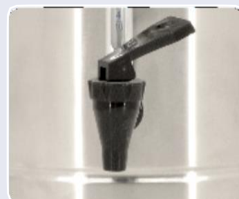
Non-Drip Water Faucet