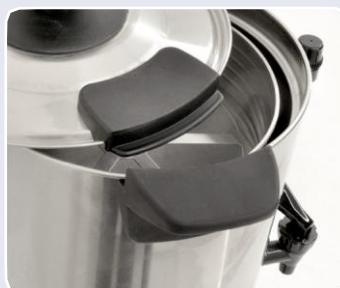
Locking Lid and Handles