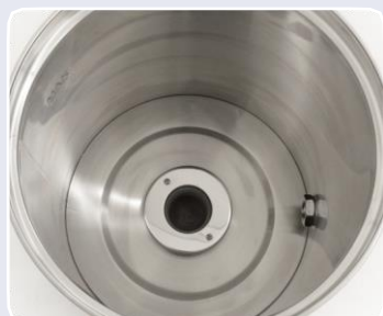
Stainless Steel Interior