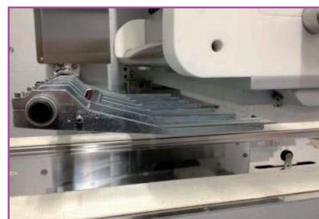
TAGLIO A FILO WIRECUT COUPE A FILE

La nostra politica é di continuo miglioramento e sviluppo. Ci riserviamo quindi il diritto di modificare le informazioni contenute in questo depliant senza nessun preavviso. Our policy is aimed to a constant improvement and development. We therefore reserve the right to amend the information given in this leaflet without prior notice.