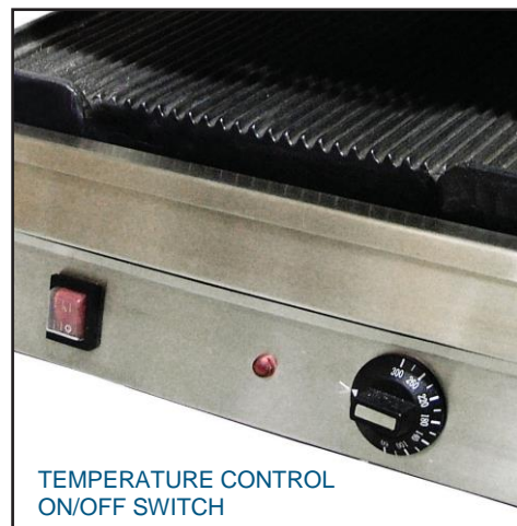
TEMPERATURE CONTROL ON/OFF SWITCH