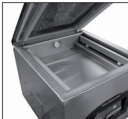
Two (2) 17" Seal Bars with Double Seal Wire