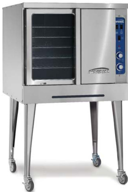
ICVE-1 shown with optional casters

Four bearings per door extend the life of the door mechanism.