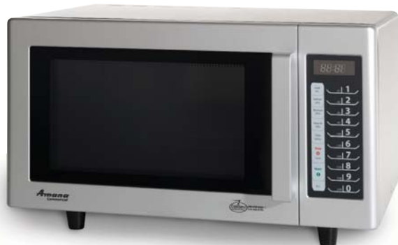
Model RMS10T and RMS10TS shown