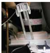
WaterSense Adaptive Purge Control